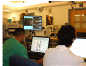
Figure 1(a): Care providers using FirstNet in the ED

ED care providers utilize a variety of digital and non-digital information artifacts during their work. The HMC ED has an electronic medical record, Eclipsys, which is integrated with a computerized provider order entry system, FirstNet (Figure 1). FirstNet is used by clinical staff to order medications and lab tests for patients.