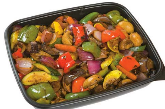
Wok Seared Vegetables