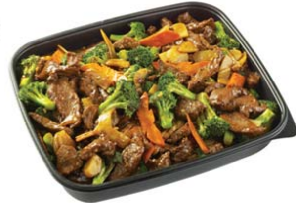
Beef with Broccoli