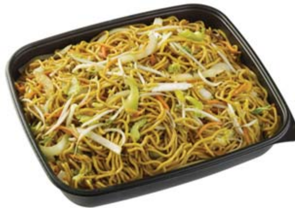
Vegetable Lo Mein