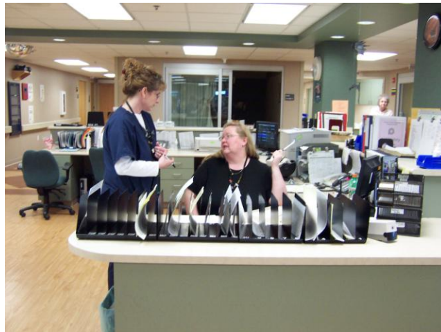
Figure 2: ED Nurse's Station