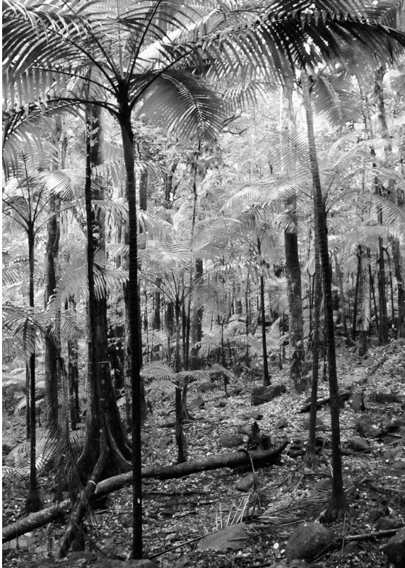
PLATE 1. Luquillo Forest Dynamics Plot, in northeast Puerto Rico, with the common palm Prestoea acuminata in the foreground.