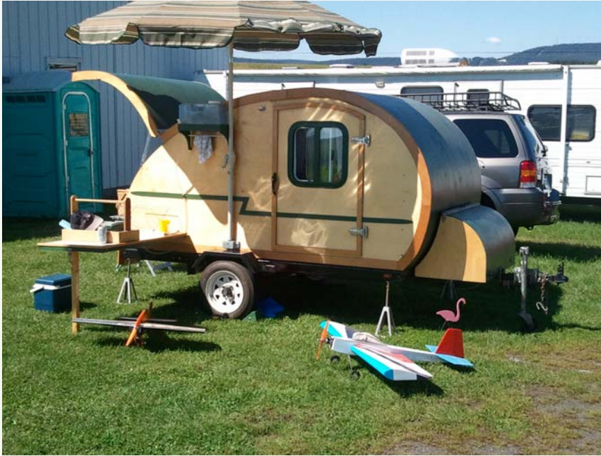
Sam Stitzer's hand crafter Teardrop Trailer

Camping, Flying, & Camaraderie were all standard fare at our September Fun-Fly. The event was well attended with visitors from Montana that were traveling through the area and the usual suspects from the Buzzard Field RC group.